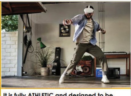
It is fully ATHLETIC and designed to be played at HOME. And any player with Wifi can play any other player in the world.