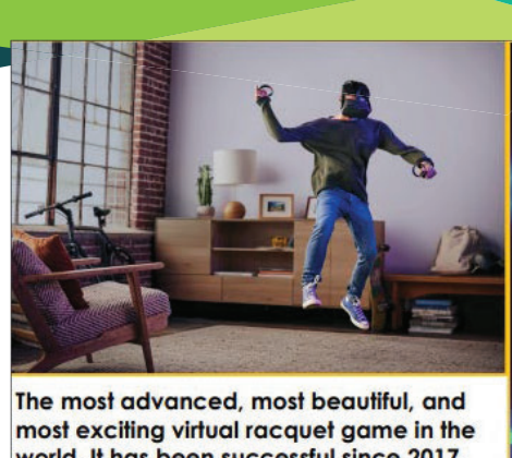
most exciting virtual racquet game in the world. It has been successful since 2017.